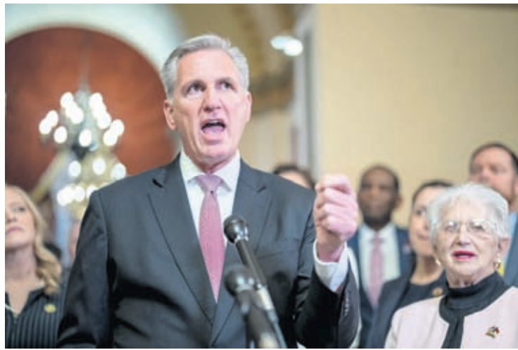
Speaker of the House Kevin McCarthy, R-Calif., joined at right by Rep. Virginia Foxx, R-N.C., chair of the House Education Committee, talks to reporters after the House narrowly passed the "Parents' Bill of Rights Act," at the Capitol in Washington, March 24, 2023.

He also told Biden, "Simply put: You are on the clock. It's time to drop the partisanship, roll up our sleeves, and find common ground on this urgent challenge. Please have your team reach out to mine by the end of this week to set a date for our next meeting." Show your plans, the White